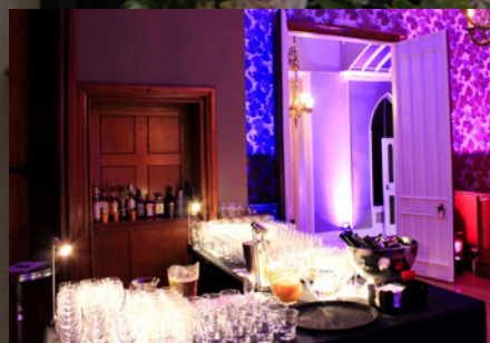
Rose room Drinks reception and Dance floor