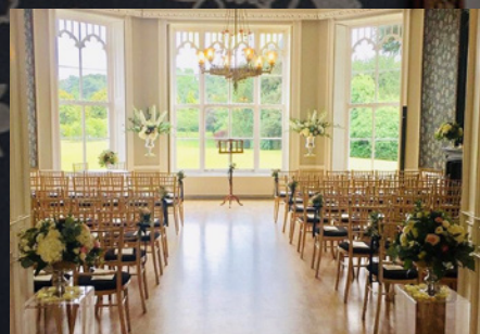
Orchid room Dining 120, Ceremony 120