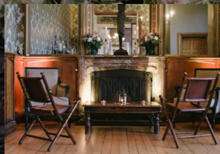
Library Bar area