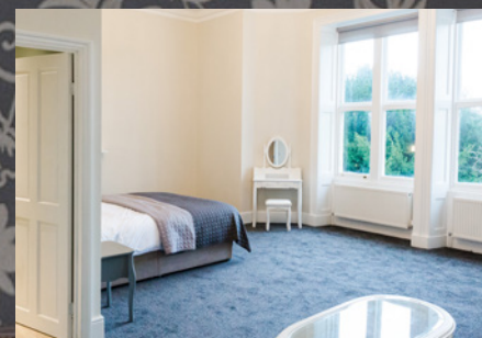
Accommodation 11 bedrooms, 7 bathrooms, 1 lounge